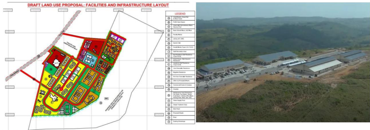
The Master Plan of the Accra Technical University Mpehuasem Campus

In 2013, the University procured 135 acres of pristine land at Mpehuasem in the Ga West Municipal Area for the establishment of an additional campus.