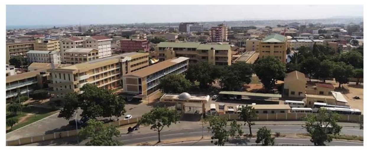
The Kinbu Campus of the Accra Technical University with the Padmore (Barnes) Road in the foreground and behind it is the Main (East) Gate to the campus.

The campus has a number of academic facilities including several classrooms and lecture halls, engineering and science laboratories and workshops, libraries, a Drone Centre, etc. Other facilities include a University Clinic, Students' Hostels, a multipurpose Sports facility with Lawn Tennis, Handball, Basketball and Volleyball courts, a modern guesthouse and cafeteria, a Students Complex, residential facilities for staff and a Book Binding Unit. The campus is situated close to key government agencies, financial institutions, industries, commercial centres, and transportation hubs.